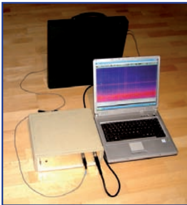
Figure 2. The receiver and power supply mounted in a small plastic housing. The connections go to the pick-up coil (in the black box) and to the laptop soundcard. The laptop is running CoolEdit.

much otherwise the amplifier will be driven into saturation by the mains signal. The receiver circuit suggested here amplifies the signal picked up by the coil before some of the 50 Hz content is removed by the first low-pass filter. The next stage provides the same amount of gain together with another low-pass filter. After the final filter the 50 Hz hum is barely perceptible on an oscilloscope display. The wanted ELF signals are however still present and can be further amplified or analysed.