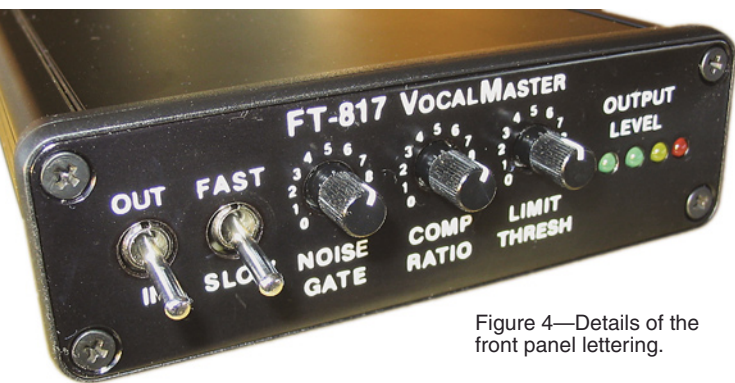
Figure 4—Details of the front panel lettering.

and panel and slide the PCB into the bottom rails of the enclosure from the rear until the front of the PCB touches the inside of the front panel. Mark the mounting hole location on the bottom of the enclosure and drill a \frac{1}{2} inch diameter hole. Scrape away any paint or anodizing around the inside of this hole to ensure a good electrical connection between the enclosure and the PCB. Attach the spacer on the bottom center of the completed PCB with a 4-40 \times \frac{3}{16} inch screw with internal lockwasher and slide it into the enclosure. Guide the controls through the front panel cutouts and insert the panel screws. Be very careful not to over tighten the front and rear panel screws as the aluminum holes are easily stripped. After adjusting R19 in the next section, slide in the top panel, rear bezel, and rear panel and install the four rubber feet on the bottom. Complete the assembly by securing the PCB mounted spacer with a 4-40 \times \frac{3}{16} inch screw with internal lockwasher from the enclosure bottom.