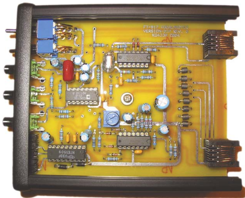
Figure 3—Inside top view of the completed VocalMaster.

compression settings. Figure 2 provides the schematic and parts list.